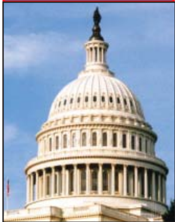
Use-of-Force Policy / B1