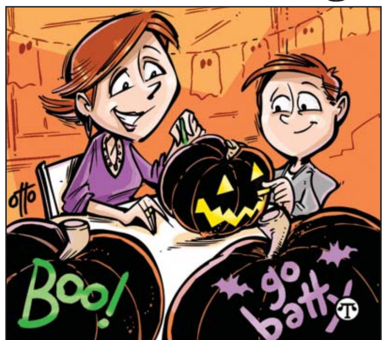
Clever ways with pumpkins can make decorating your home for Halloween as easy as pie.

Ghoulish ghosts. Wicked witches. Things that go bump in the night. What better way to have a little Halloween fun than to decorate your home for that spooky night?