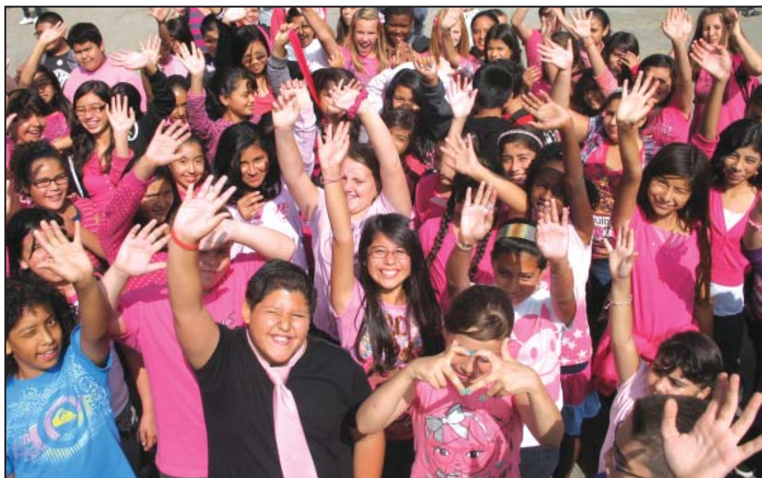
Slauson Middle School students wear pink clothing in support of "Pink Friday" on October 21, in recognition of National Breast Cancer Awareness Month.