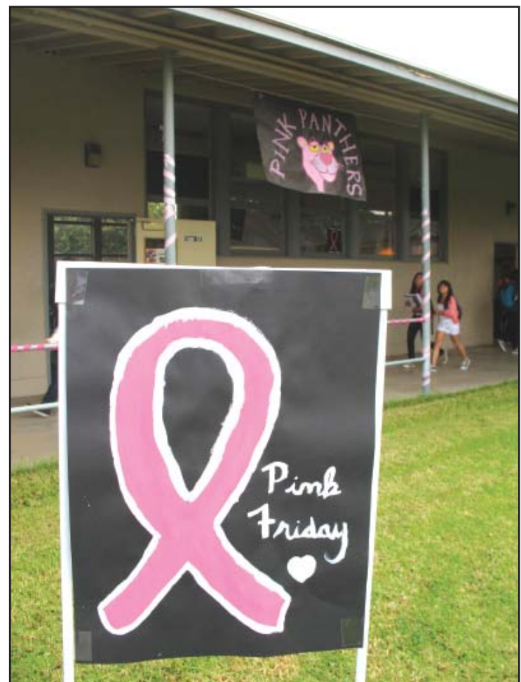
Slauson Middle School's mascot, black panther, became the "Pink Panther" on Friday, October 21 in recognition of National Breast Cancer Awareness Month. Pink ribbon and a pink panther posters were displayed at the school's main entrance.

This was a great educational and entertaining event for everyone.